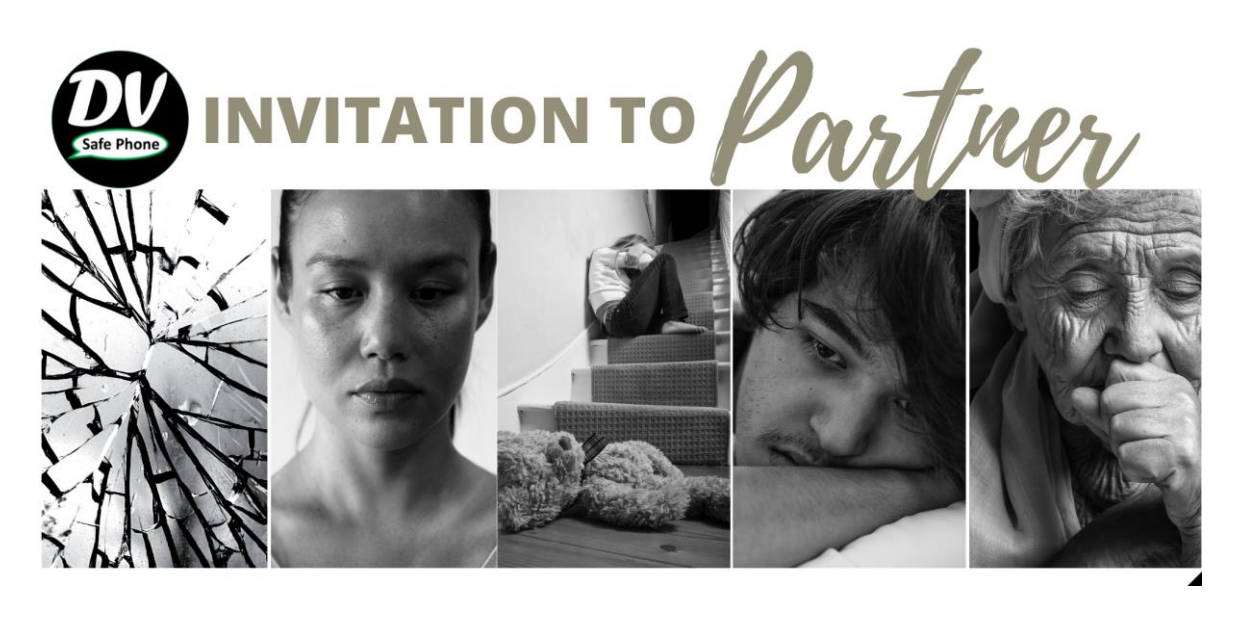
Expression of interest to Partner with Your Rotary Club

Date: 14 September 2023 at 6:40:12 pm AEST To: Olaf Zalmstra <<u>info@chelsearotary.org.au</u>>