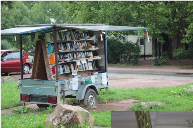
Mobile library/book swap trailer.