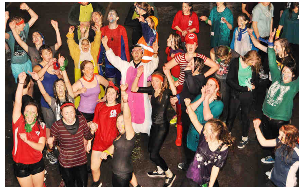
A typical Camp Awakenings activity.