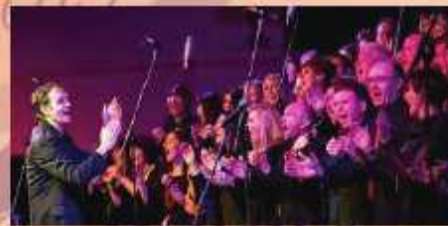
Melbourne Gospel Choir