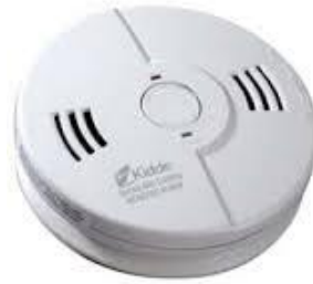
Smoke Alarms $17

Thanks to Edithvale Fire Station for bringing these to our attention.