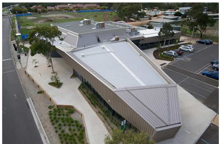
Patterson Lakes Community Centre

More details will be provided as we get closer to the big day!