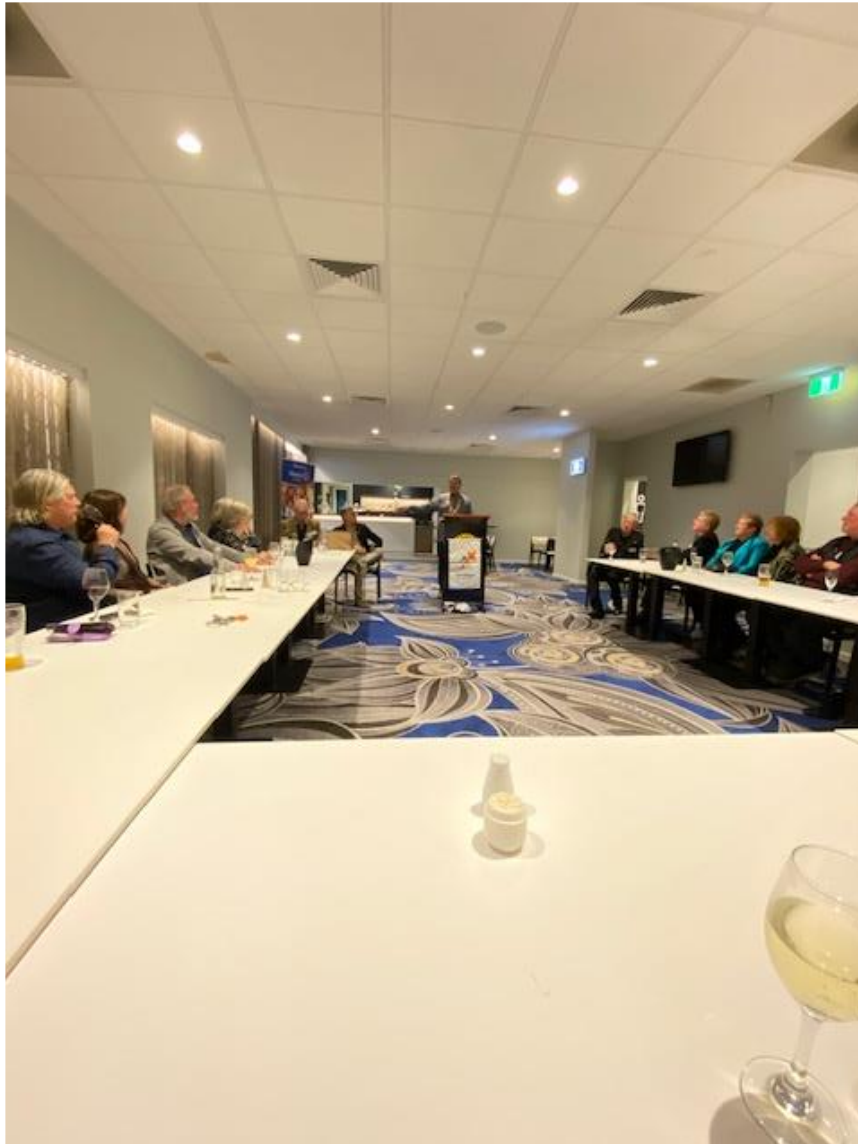
Changeover Night 2024 at the Chelsea Longbeach RSL