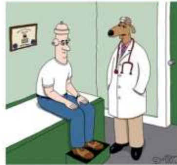
"I'm afraid I can't treat you, Mr. Fisk. I have a conflict of interest."