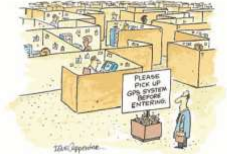
PLEASE PICK UP GPS SYSTEM BEFORE ENTERING.