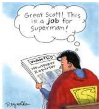
Great Scott! This is a job for Superman!