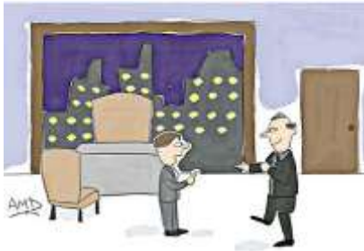
"Okay, two words ... second word rhymes with tired."