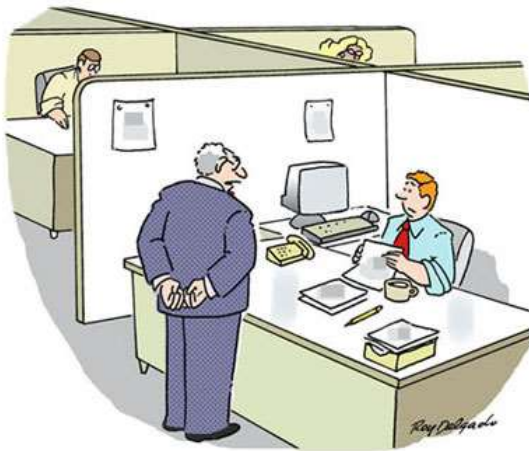
"This promotion means you'll be getting the blame directly from me."