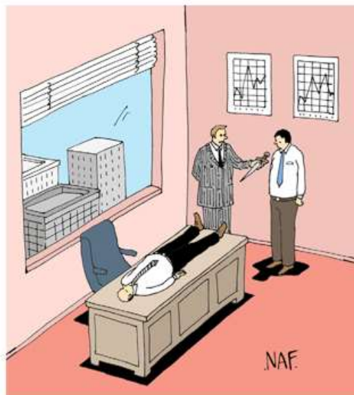
"What's the problem? We told you when you started you'd have to make some sacrifices."